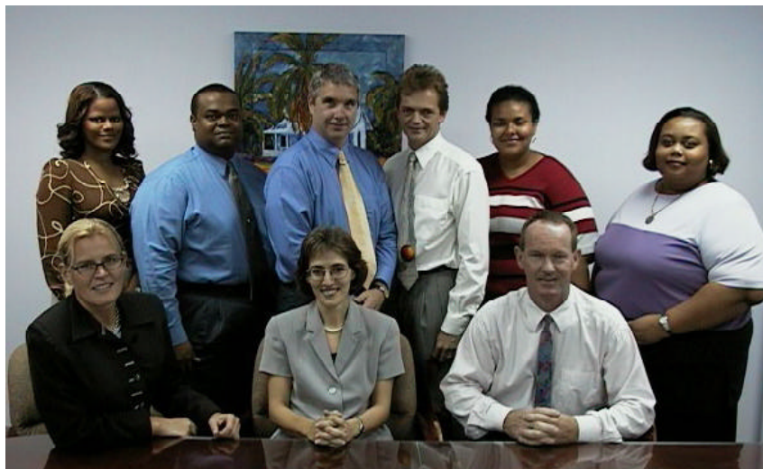
CSX Senior Executives and staff members